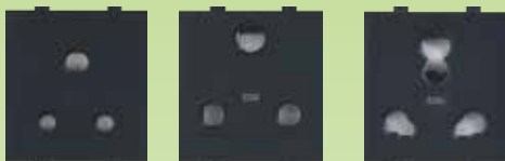
21102MB 21124MB 30828MB