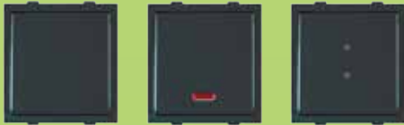
21510MB 34964MB 21521MB