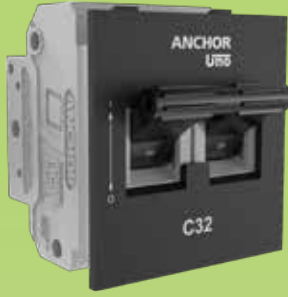
Roma Classic Mini MCB DP