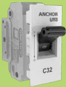
Roma Classic Mini MCB SP