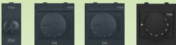
22546MB 21496MB 22036MB / 20507MB 22037MB

16A,20A,25A Switch not suggested for geyser load. Instead MCB/Motor Stater must be used.