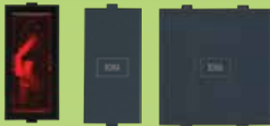
21180RMB 21598MB 30420MB