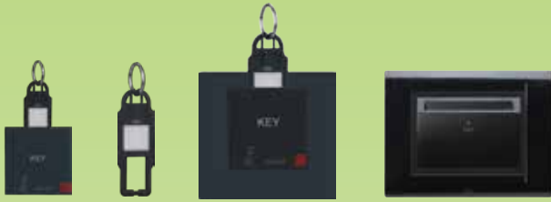
21770MB 20868MB Final Look 20482MB

• 35774 - Suitable for AMP5, krone, Systimax Jacks • 35220 - Suitable for Avaya Lucent