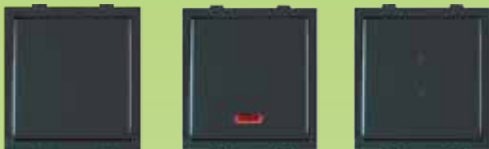
21532MB 21769MB 21543MB