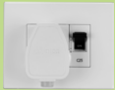
98496 / 98497