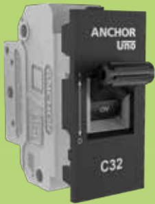
Roma Classic Mini MCB SP