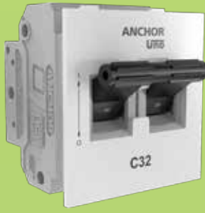
Roma Classic Mini MCB DP