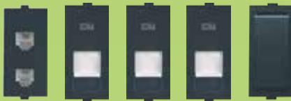
34942MB 35763MB 35752MB 35774MB 21146MB