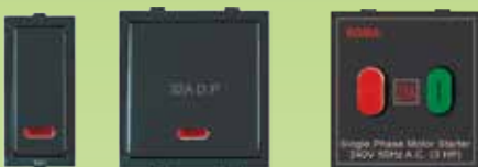
22014MB 21984MB 20405MB