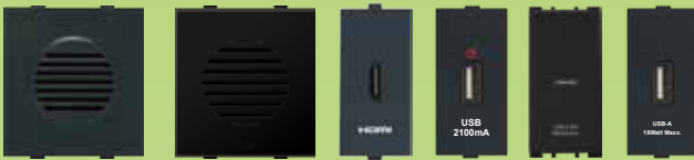
21204MB 21205MB 21996MB 20462MB 21206MB 21207MB

• 35774 - Suitable for AMP5, krone, Systimax Jacks • 35220 - Suitable for Avaya Lucent