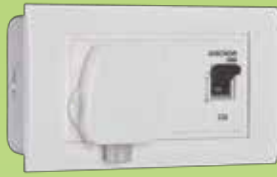
98491 / 98492