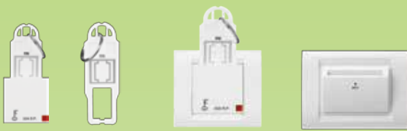
21770 20868 Final Look 20482

• 35774 - Suitable for AMPS, krone, Systimax Jacks - 35220 - Suitable for Avaya Lucent