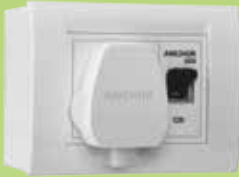
98488 / 98489