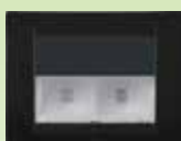
22614MB / 22615MB 22616MB