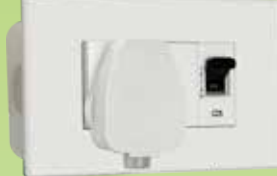
98498 / 98499