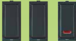
21066MB 21088MB 21077MB