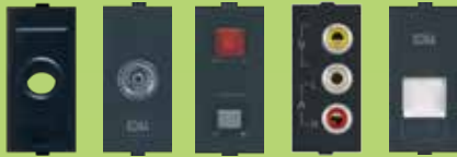
30045MB 21157MB 20358MB 20471MB 20857MB