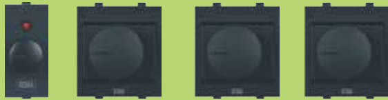
20799MB 21190MB 30351MB 30046MB