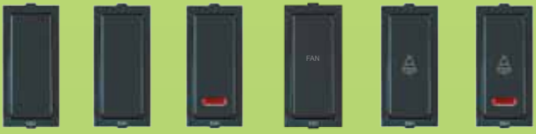
21011MB 21022MB 21033MB 30840MB 21044MB 21055MB