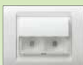
22614 / 22615 / 22616