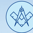
Engineering & Designing