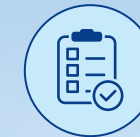
Site Survey & Analysis