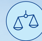
Feasibility & Planning

Your Solar EPC partner through complete project Life cycle