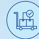
Procurement & Sourcing