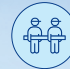
Construction & Installation