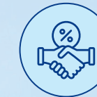
Testing & Commissioning