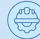
Operation & Maintenance